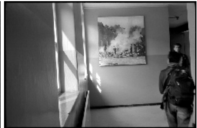
About Auschwitz : photographs 1 and information exhibited at Vanier during the 2003 Annual Cégep Holocaust Symposium.